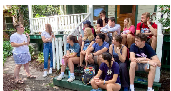
New Amate House fellows on the steps of the Catholic Worker during their two-week August orientation.