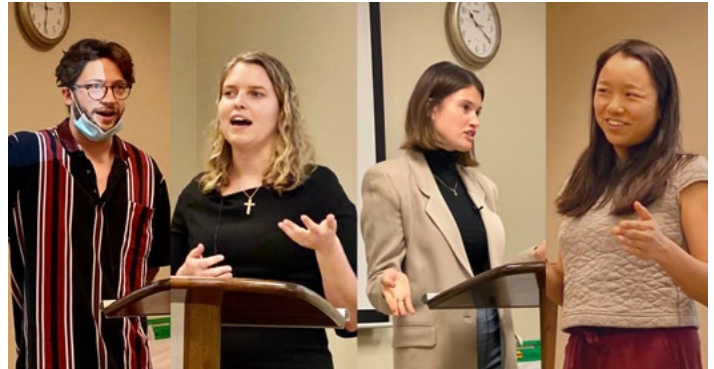
Fellows present their “TEDxAmate” talks to their peers and staff on May 14th at the Cardinal Meyer Center.

Needless to say, we decided to host a “TEDxAmate” day again this year, and once again, it was inspiring, encouraging, and life-giving. Even more exciting was being able to gather in person for the event.